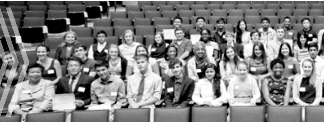
2014 Arlington Community Foundation Scholarship Recipients

The Arlington Community Foundation is the largest private provider of scholarships to high school students in Arlington. In 2014, the Foundation awarded 64 new scholarships worth $389,000. We currently manage 45 scholarship funds to meet a variety of personal charitable purposes. Contact us today to discuss establishing your own scholarship fund or support an existing fund and make a difference in a student's life!